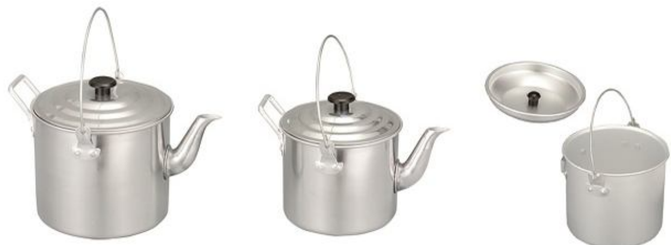
AC105 TEA POT 2.5L